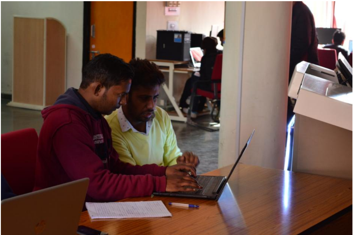
Team Work is the key to success