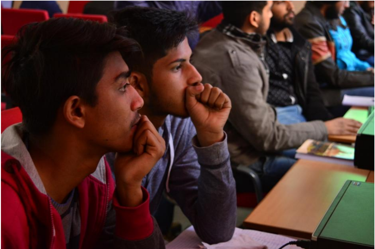
Some tense moments